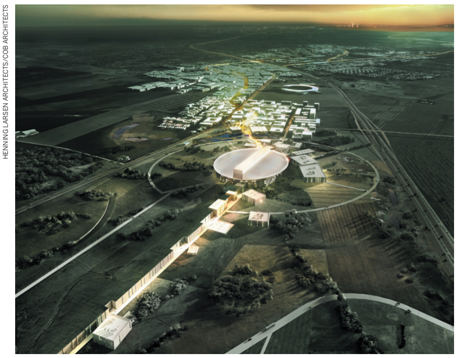
The European Spallation Source will be built in Lund, Sweden (artist's impression).

ART MIT Glass Lab poised for a US$2.5-million refurbishment p.617